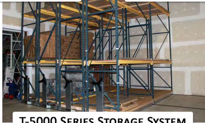
T-5000 SERIES STORAGE SYSTEM