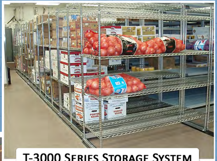
T-3000 SERIES STORAGE SYSTEM