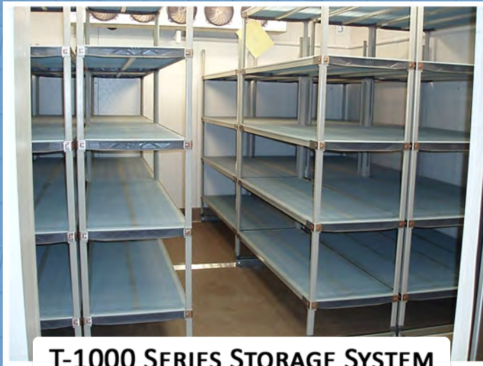
T-1000 SERIES STORAGE SYSTEM